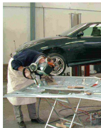
MIG-Aluminium: engine bonnet of AlMg-alloy

LÖTMIG 280 Program is special designed for MIG-brazing, Aluminium welding and MAG-welding of thin plates and profiles, like galvanised high strength car plates or aluminium plates.